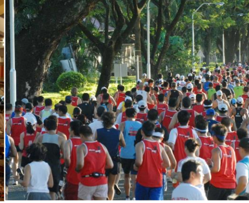
Fun Run at Parade Ground