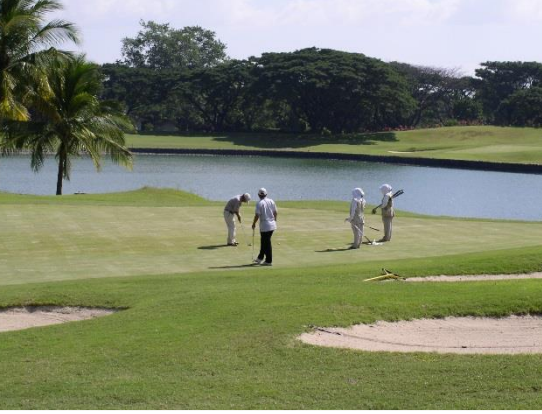
Mimosa Golf & Country Club