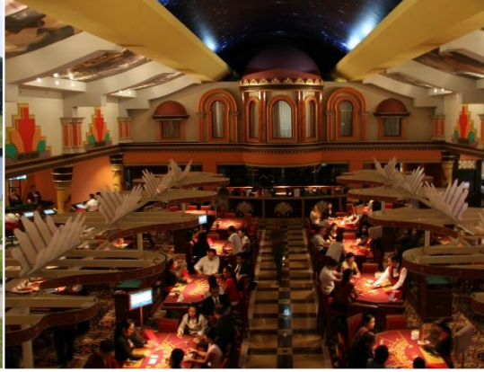
Casablanca Casino Gaming