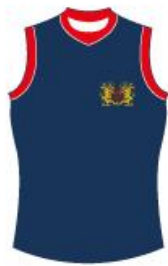
HONG KONG DRAGONS