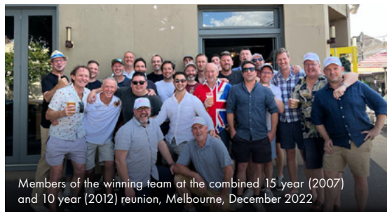
Members of the winning team at the combined 15 year (2007) and 10 year (2012) reunion, Melbourne, December 2022

Bali Geckos 5 - 9 - 39 Jakarta Bintangs 4 - 3 - 27